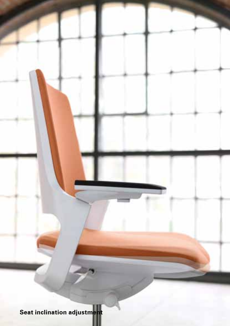
Seat inclination adjustment