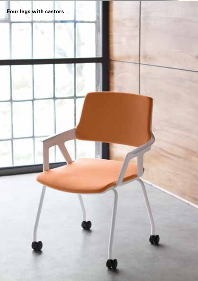
Four legs with castors