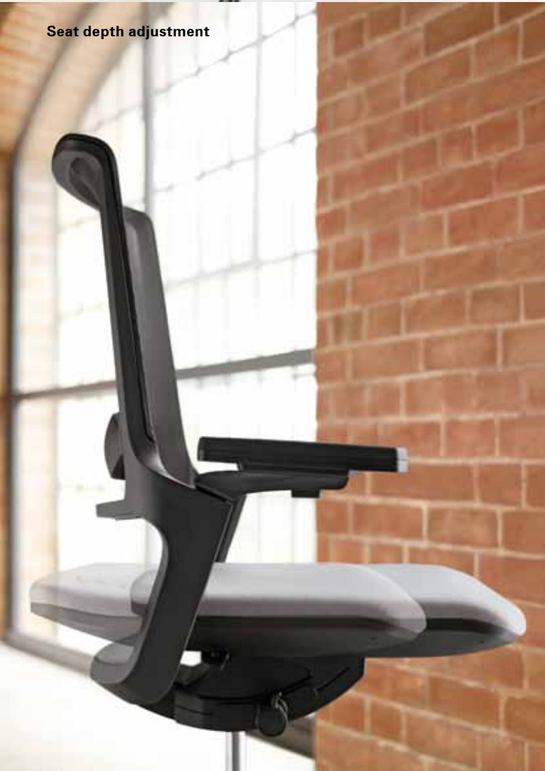
Seat depth adjustment