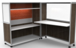
Mobile Office—Base MBOX304852-BASE—$2995 List