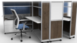
2 Pack Linear