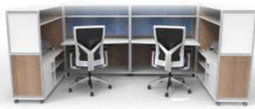
2 Pack Linear