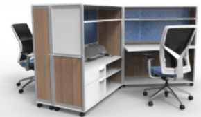
3 Pack Pinwheel