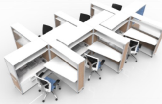
6 Pack—Back to Back