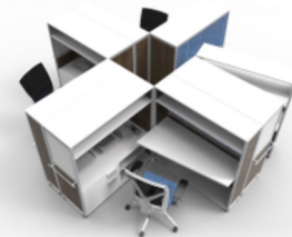
4 Pack—Back to Back