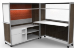
Mobile Office—Full MBOX304852-FULL—$3,995 List