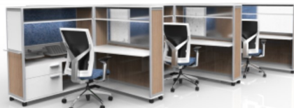
3 Pack Linear